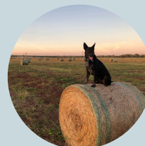
Hay and fodder